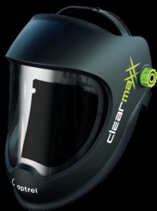
Art.-Nr. 1100.000 optrel clearmaxx standard version