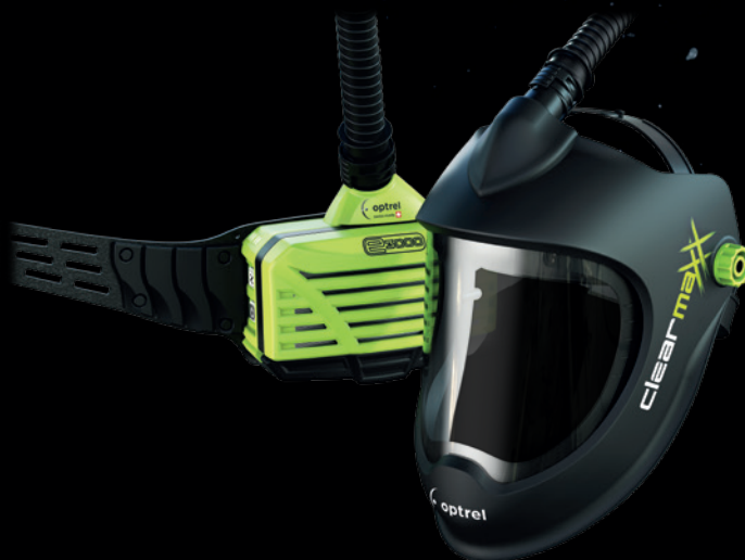
Art.-Nr. 4900.020 optrel clearmaxx PAPR-Version (e3000 PAPR system has to be ordered separately)